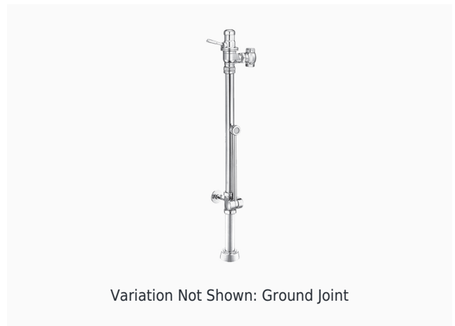
Variation Not Shown: Ground Joint